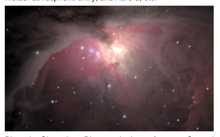
<u>Binocular Observing</u> - Discover the Lunar features, Constellations and various stellar and planetary objects, and "Star-Hop" your way around the sky. Learn what's in the night sky.

<u>Astrophotography</u> - Photograph the many interesting objects and phenomena visible in the sky: the Moon; Planets; the Sun; Sunspots; Galaxies; Nebulae; and Star Clusters; Meteors; Meteor atmospheric entry; and Aurora; etc.