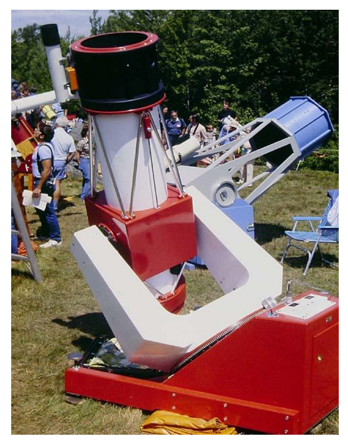
<u>Variable Stars</u> - Visually observe stellar light intensity changes and report the data to the AAVSO.

<u>Telescope Making</u> - Grind your own mirror, make the mount, and/or build your own observatory. Enter your creation at the annual Stellafane, Riverside Conventions, or other national telescope making events.