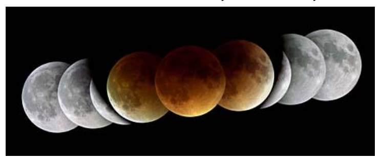
<u>Moon & Planets</u> - Observe the Moon and/or planets and report the data to the various divisions of the American Association of Lunar and Planetary Observers (ALPO).

<u>Lunar Eclipses</u> – Observe, and photograph the passage of the Moon into the Earth's shadow from your own back yard.