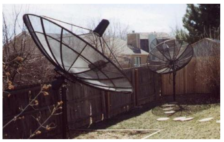
<u>Solar Eclipses</u> - Travel the globe to observe, photograph and record data about these most spectacular, awe inspiring, and probably the most beautiful of celestial events.

Radio Astronomy - Observe the Universe in the Radio Spectrum (Solar Events, Jupiter Eruptions, Map the Milky Way Galaxy) Detect Sudden Ionospheric Disturbances [SIDs].